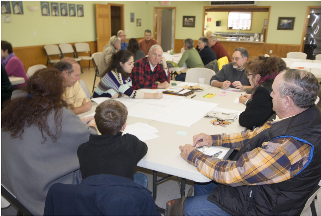
1st Envisioning Meeting