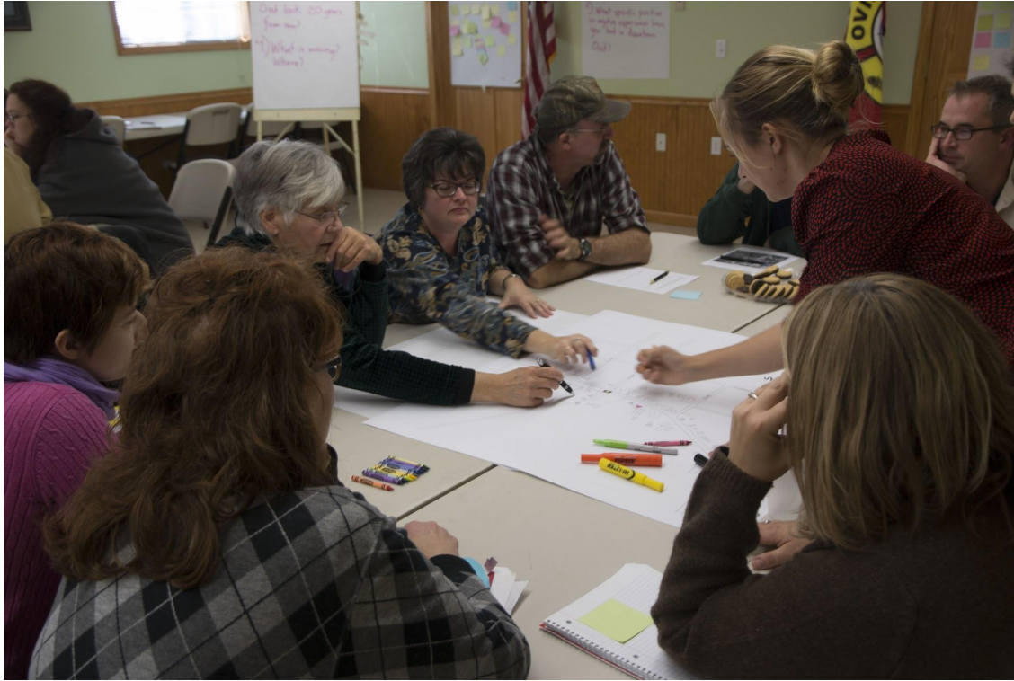
1st Envisioning Meeting